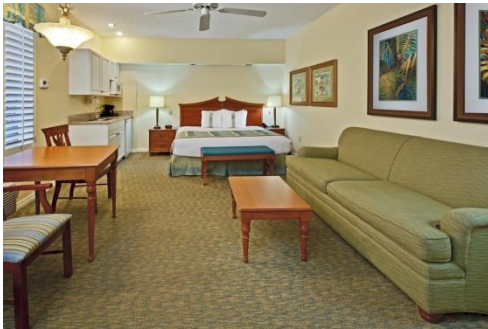
Studio with King Bed