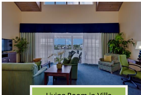
Living Room in Villa