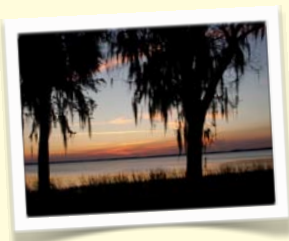
Twilight at Mission Inn Resort & Spa

The conference registration fee remains unchanged at $100. This charge also includes the annual membership fee.